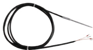
Lead wire type